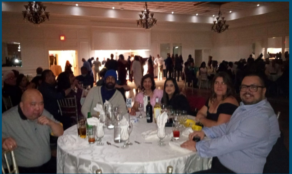
Steelworkers Toronto Area Council Stewards Dinner & Dance 2024